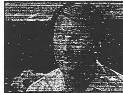
Source: Clip from the interview with John Edwards on Nightline , ABC Television Network, August 8, 2008. Figure 1: The focus on John Edwards's face as he says "can I explain what happened ," excerpt (i), line 2

In response to Woodruff's "how-could-you challenge," Edwards leans slightly forward into the interviewer, with raised eyebrows, gazes fully toward Woodruff, and asks back "can I explain what happened" (line 2). His demeanor is deferential – not defensive – but he assertively presents a knowing sense of self, inviting the audience into his "knowing position." When he repeats this introduction for his biographical tour through his life stages in line 6, the camera focuses for a moment on the interviewer – suggesting that some other piece or pieces of what has been said may have been edited out. Starting from his boyhood, he works himself into a narrative style that is oriented toward the interviewer. With line 16, Edwards changes