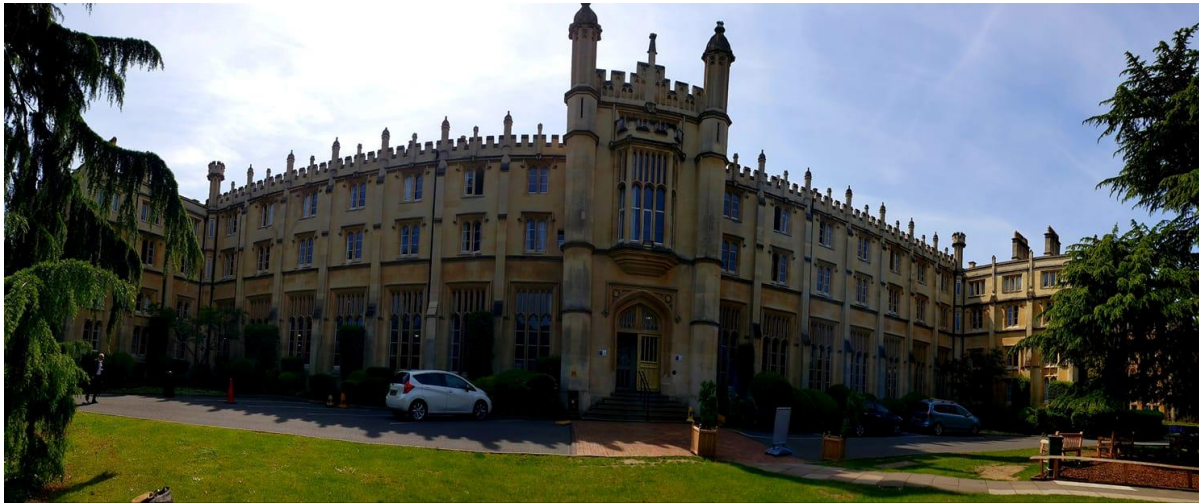
Figure 2: Main building of Richmond, the American International University in London, host of the inaugural conference of the Centre for the Analysis of the Radical Right

In June of 2019, I also spoke on this subject at the inaugural conference of the Centre for the Analysis of the Radical Right, hosted by Richmond, the American International University in London, which incidentally has a distant relationship to Henry J. Leir—it is the alma mater of Prince Louis of Luxembourg.