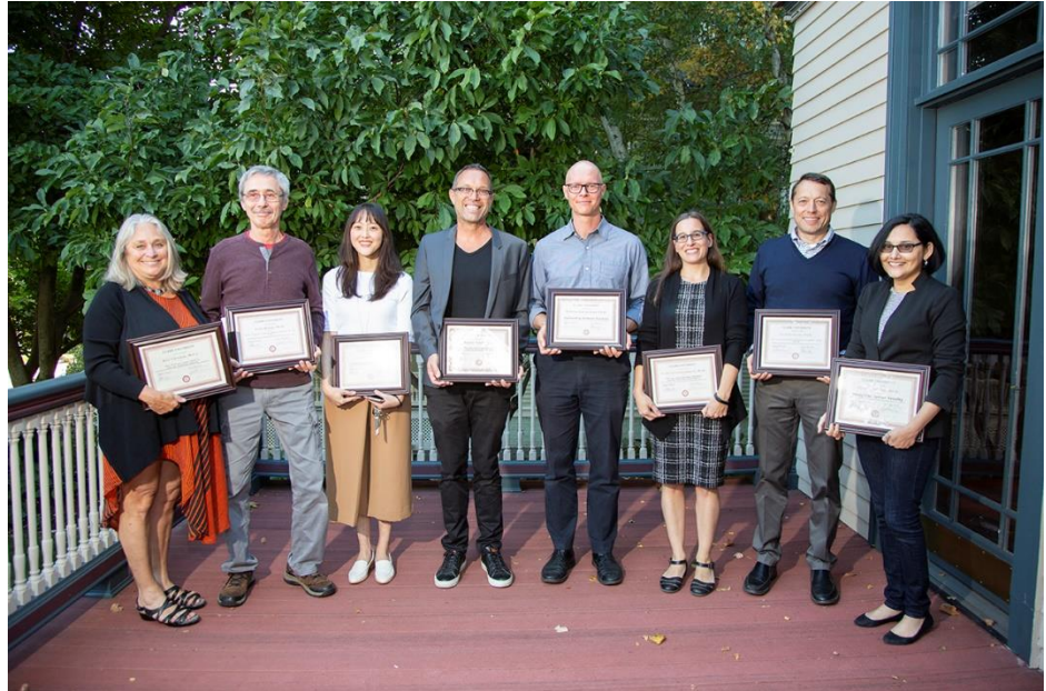
Figure 8: Recipients of faculty awards

In addition to the Key to the City, I was honored to receive the Steinbrecher Senior Faculty Award in the Fall of 2019. This kind of recognition is so important for faculty morale! Clark Now wrote up the awards here.