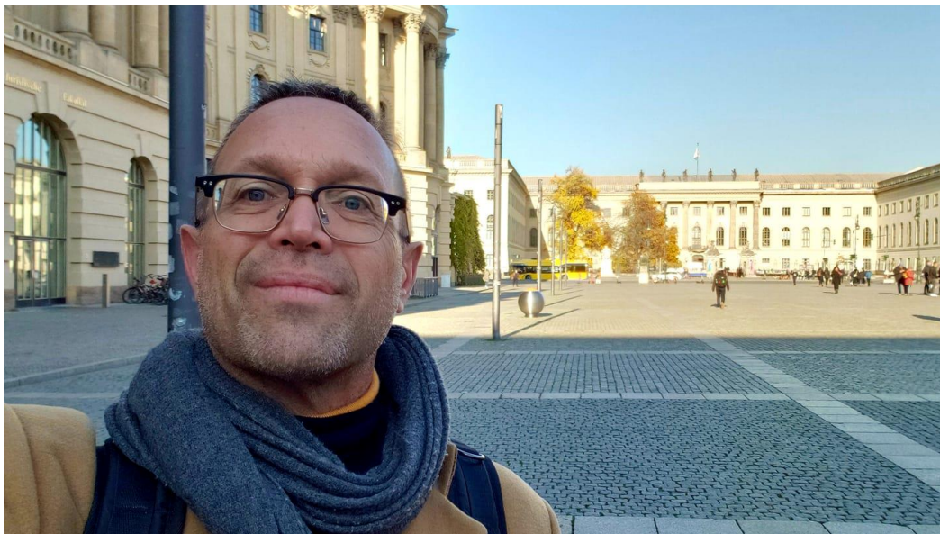
Figure 5: At Humboldt University in Berlin

My talk, “Jews, Human Rights, and the Right” at Berlin’s Schwules Museum, the oldest and most significant gay museum in the world, was the keynote speech at the conference, “Jews and Queers in German-Speaking Europe and Mandatory Palestine/Israel,” where I got to interact with a substantial number of Israeli scholars.