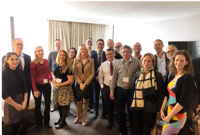
Figure 3: Seminar on Nazi Legacies in America Today, at the German Studies Association

I was also able to contribute my knowledge of Evola to a three-day seminar called “The Nazi Legacy in the United States” at the German Studies Association in Portland, Oregon, in October, 2019. As a result of this presentation, I will be submitting an article on Evola’s ongoing influence in right-wing intellectual circles to a special issue of the Journal of Holocaust Studies .