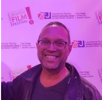
Figure 9: At the San Diego International Jewish Film Festival