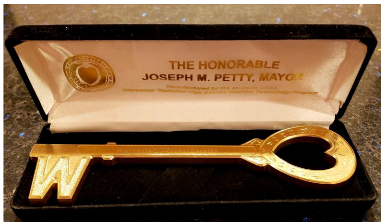
Figure 7: The Key to the City of Worcester

At the book launch, the City of Worcester awarded me and my co-authors the Key to the City of Worcester for our work on local LGBTQ+ history. The award letter declared, “the history of our community’s most marginalized and unrecognized communities are the most vital and need to be shared and celebrated.” Clark Now wrote up a full account of the award .