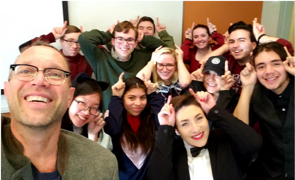
Figure 7: Faustians Being Devilish

I am happy to say that I had a very successful semester teaching the Faust myth to a motivated group of 12 students, who were able to read all of Goethe’s Faust (both parts 1 and 2), as well as Thomas Mann’s lengthy novel, Doktor Faustus .