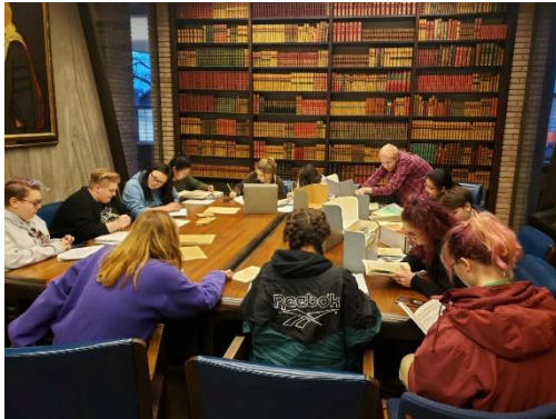
Figure 8: Students researching Clark's LGBTQ+ History in the archives of Goddard Library.

The exhibit on Worcester LGBTQ+ History mentioned above completely changed my sexuality courses, “Sexuality and Human Rights” in the fall of 2018 (15 students) and “Sexuality and Textuality” in the spring of 2019 (17 students). They helped perform the research and write the catalog for the Clark satellite exhibit.