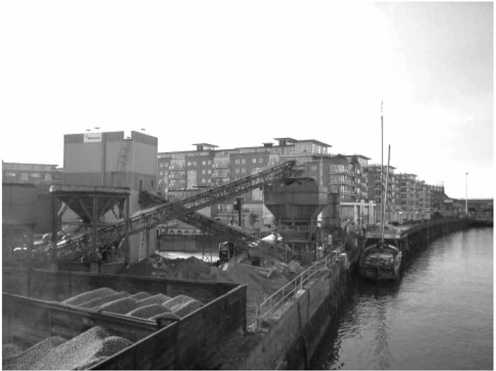
Figure 2. Riverside West, Wandsworth. Riverside West stands on an old gas works next to a cement plant and the riverside refuse dock. It constitutes one development in a string of nine along this part of the river.

The cost of the apartments ranges from £244 950 for a two-bed apartment to £570 000 for a three-bed apartment.