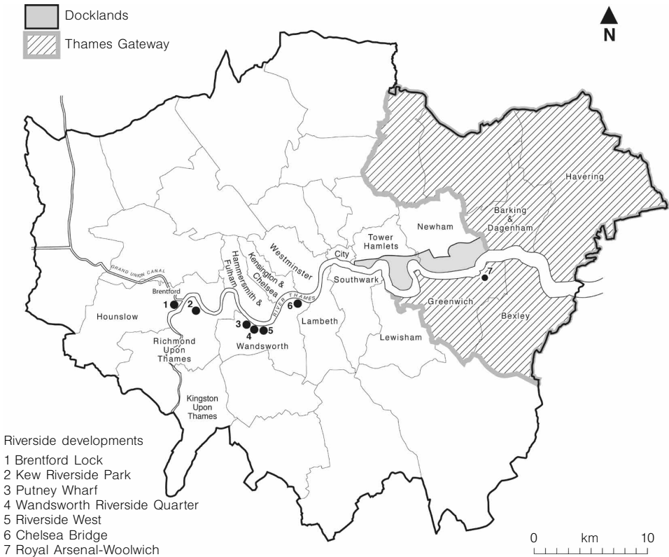
Figure 1. Map of London's riverside (drawn by Roma Beaumont).

The redevelopment both of Docklands in the 1980s and of its new-build residential landscape shares some similarities with the new-build riverside renaissance happening in other locations along the Thames today but there are significant differences too. The Docklands redevelopment concerned a relocation of business (the City) through (what eventually became) (5) a publicly subsidised programme of large-scale redevelopment and in tandem it underwent tremendous residential change in the classic Thatcher model of erasing the working-class history and geography of the city in order to make everyone middle class (see Bentley, 1997; Brownill, 1990; Smith, 1989). In contrast, contemporary new-build developments along the Thames are not connected to the relocation of the City; they are smaller in scale, privately funded, tend to be located in the traditional retail and commercial core of the city, and are fundamentally tied to New Labour attempts both to attract the middle classes back to the central city and, in so doing, to instigate social mixing in an attempt to defeat social exclusion and urban malaise (see Imrie and Raco, 2003). We look now at the rhetoric and reality of those attempts because in addition to making the case for new-build 'gentrification' we also want to demonstrate that, despite government (at all levels) rhetoric that tries to sell prescriptions for urban renaissance as conducive to social mixing, the result is gentrification and social polarisation.