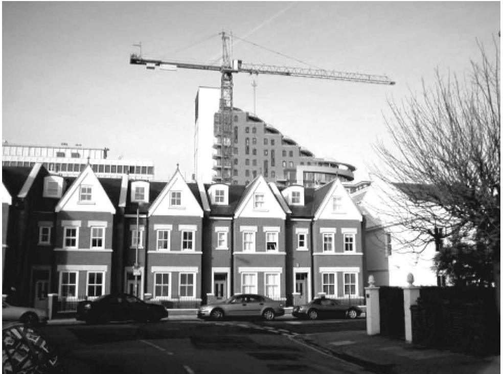
Figure 4. Putney Wharf, Wandsworth. Both this new-build tower and the renovated terraced housing below are part of the One Putney Wharf scheme.

“The Royal Arsenal London, dates back 300 years as a site for the manufacturing of ordnance and has played a vital role in the development of the British Empire and the defence of the Realm ... . The original architects of the Royal Arsenal include Sir John Vanbrugh and Nicholas Hawksmoor, whose legacy of baroque beauty can be seen all over England but nowhere more magnificently than on this historic and famous landmark site. The unique location of the Royal Arsenal London offers residents an unrivalled opportunity. Homes will combine the comforts of life in the new millennium with the elegance and heritage of centuries past, and all within commuting distance of Canary Wharf (just 4 miles away) and the City of London