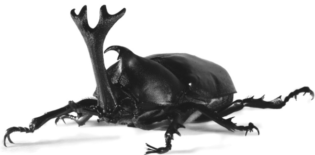
Figure 1. Large male Trypoxylus dichotomus showing the long, branched head horn and sharp thoracic horn.

If horns stunt the growth of other body parts, then horn length should be negatively correlated with the four other body parts, after accounting for variation in body size. We therefore expected a negative partial effect of horn length in the GLMs predicting the size of wings, eyes, tibiae and aedeagi.