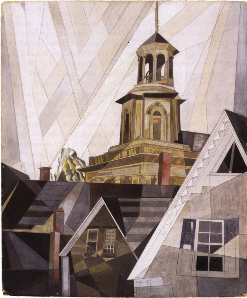
3 Charles Demuth, After Sir Christopher Wren, 1920. Watercolor, gouache, and graphite on cardboard, 24 x 20 in. The Metropolitan Museum of Art, New York, N.Y. Bequest of Scofield Thayer, 1982 (1984.433.156).