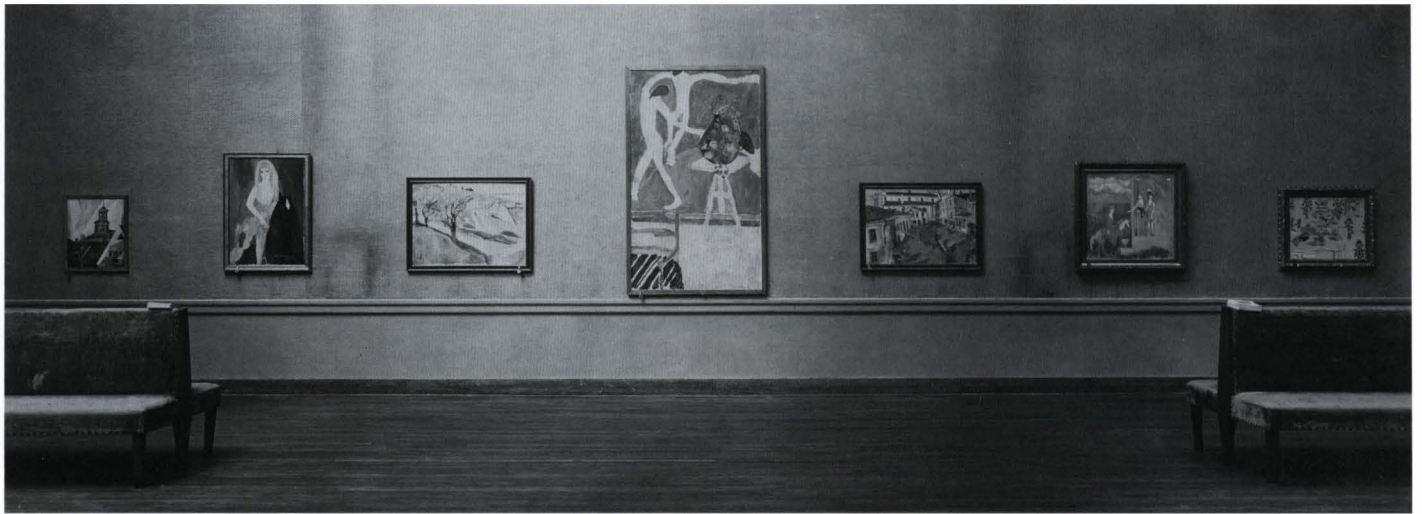
2 Installation view (detail), Exhibition of The Dial Collection of Paintings, Engravings, and Drawings by Contemporary Artists , March 5–30, 1924. Worcester Art Museum, Worcester, Mass., WAM Archives, 1924 Dial Collection Exhibition.

[of the exhibition] before the Trustees of the Museum. As is inevitable with an exhibition of this sort, reference was made to certain criticism of modern exhibitions which we have had in the past. I was asked if I had seen your collection. On my saying 'No', I was requested to do so." 13